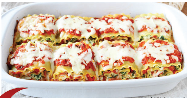
Spinach Artichoke Lasagna Roll Ups Two Peas and Their Pod